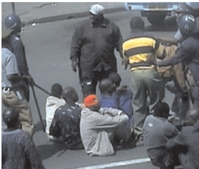
Police rounding up ZCTU leaders on Sept 13 2006