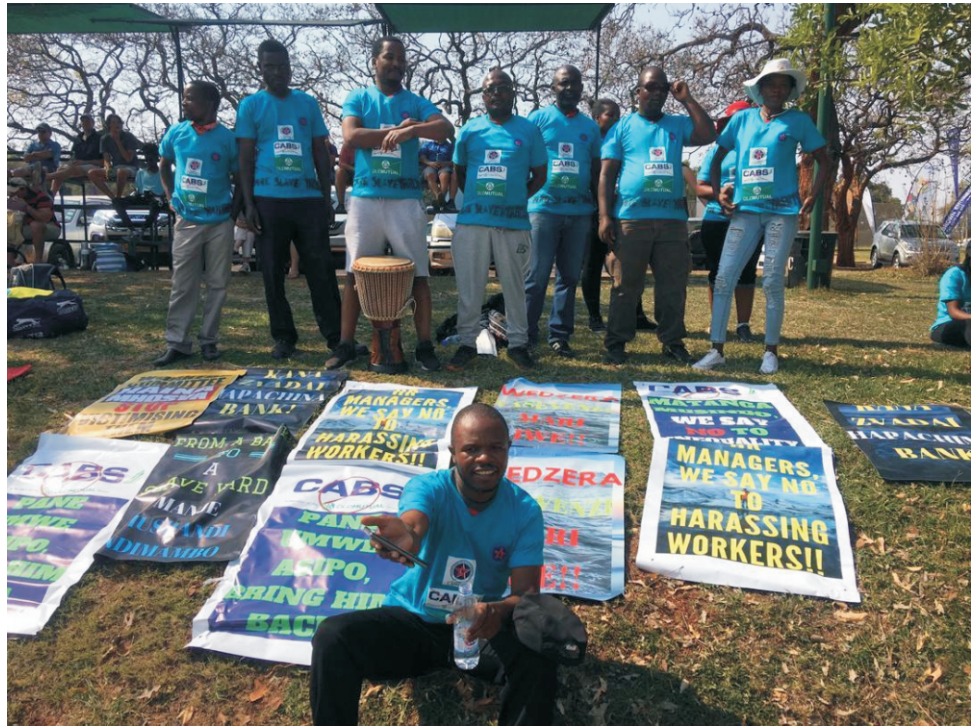
Demonstrators at the T20 cricket match in Harare