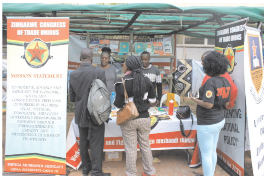
ZCTU exhibitors attending to visitors at the ZIBF