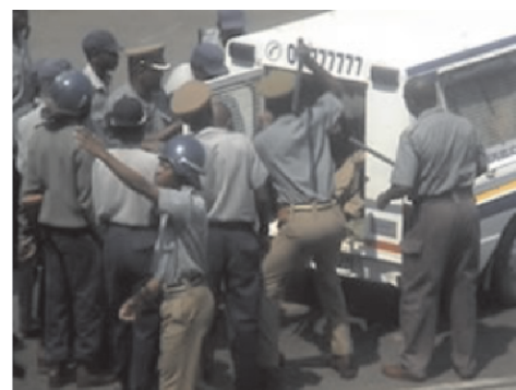
Police beats up trade unionists during arrests in the streets of Harare