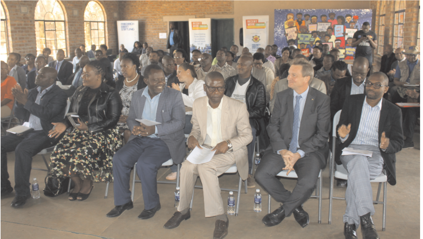
Decent Work Zimbabwe partners at the launch of the project last month