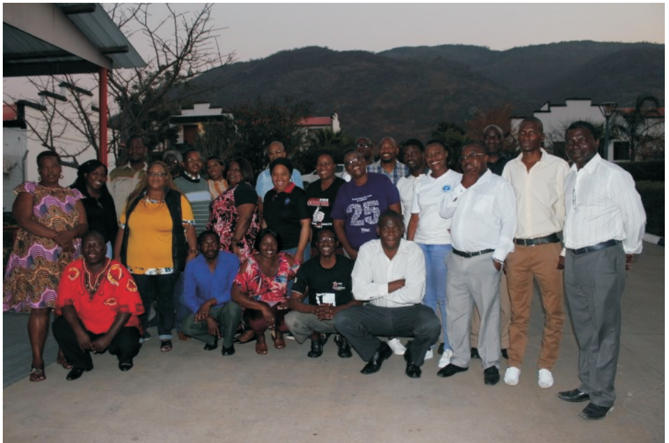
ZCTU GBV Education & Training Manual writing and editing team

The manual examines the extent of the problem of GBV in the workplace, trade unions and communities and offers remedies. It also has aspects of the new ILO instruments on violence